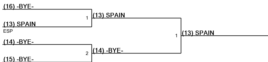
Table of 2 (Pl. 13-14)